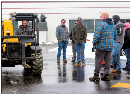
A student practices the skills he just learned in a free Forklift operation and safety course in February 2025 at Safety Fest.