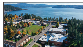
North Idaho College 1000 W. Garden Avenue Coeur d'Alene (208) 769-3300 | nic.edu