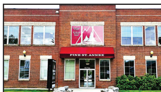
NIC at Sandpoint 515 Pine Street Sandpoint (208) 769-3214 | nic.edu/wtc