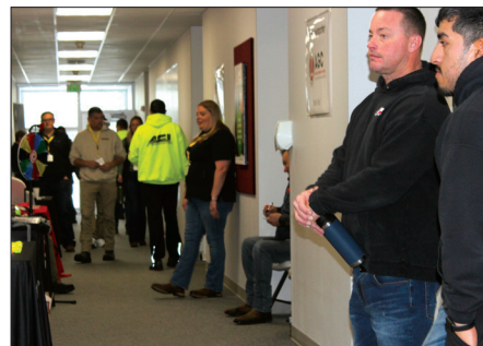
Students check out vendor tables as they wait for their next free training course to begin during Safety Fest 2025.