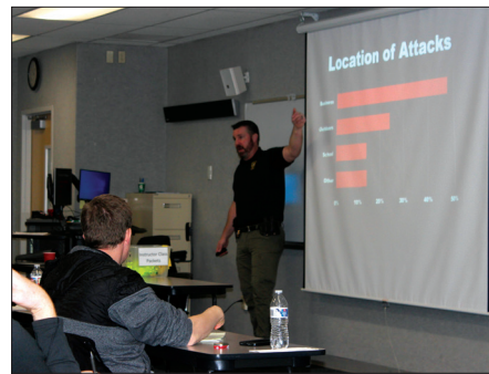
Students learn what to do in the event of an active shooter during Safety Fest 2025.