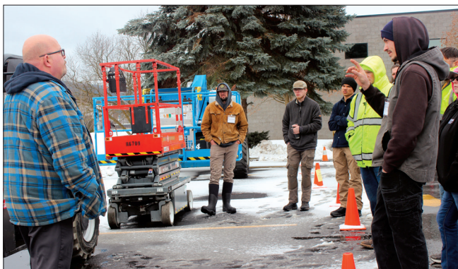
Students learn the basics of scissor lift safety during Safety Fest 2025.

Safety Fest has grown into one of the region's most collaborative safety events. Expert instructors volunteer their time to share the latest best practices in workplace and community safety, covering