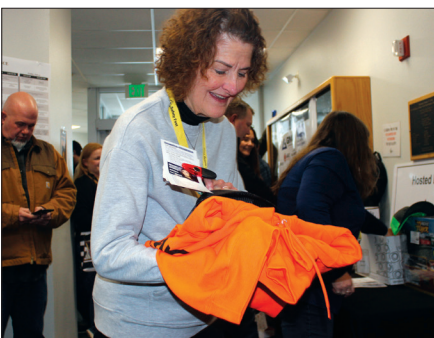
A volunteer looks over a door prize she won during Safety Fest 2025 at the NIC Workforce Training Center.