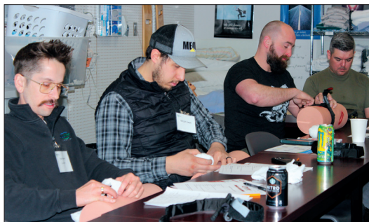
Students taking a free First Aid class practice the skills they are learning during Safety Fest 2025 at the NIC Workforce Training Center.

Registration for the February 2026 event opens in January. For more information, visit nic.edu/safetyfest .