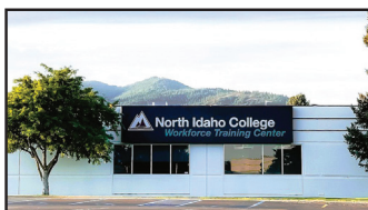
NIC Workforce Training Center 525 S. Clearwater Loop Post Falls (208) 769-3214 | nic.edu/wtc