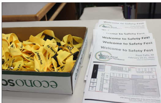
Lanyards and programs await students who will attend the 17th Annual Safety Fest of the Great Northwest in February 2025 at the NIC Workforce Training Center.