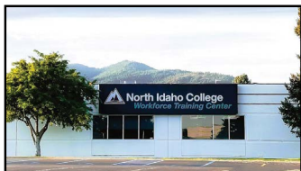
NIC Workforce Training Center 525 S. Clearwater Loop Post Falls (208) 769-3214 | nic.edu/wtc