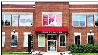
NIC at Sandpoint 515 Pine Street Sandpoint (208) 769-3214 | nic.edu/wtc