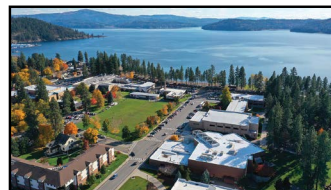
North Idaho College 1000 W. Garden Avenue Coeur d'Alene (208) 769-3300 | nic.edu