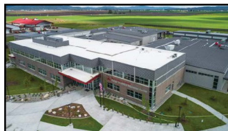
Parker Technical Education Center 7064 W. Lancaster Road Rathdrum (208) 929- 4040 | nic.edu/tech